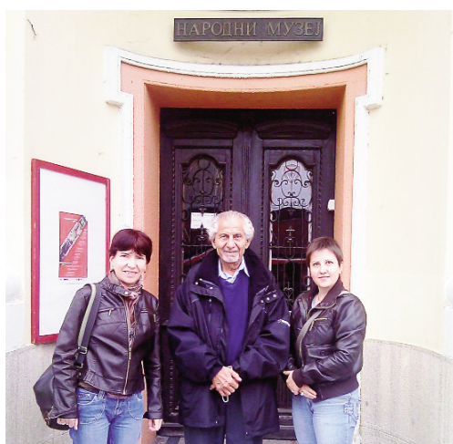
In front of the Museum in 2007