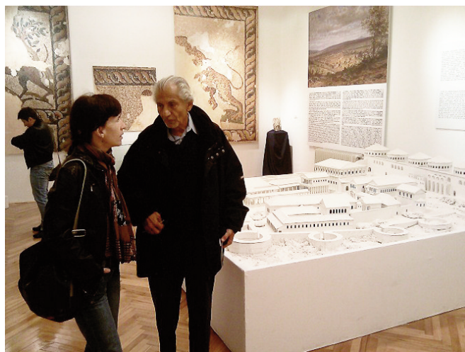
At the model of Felix Romuliana, 2010